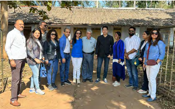
NEC members visiting their roots at Dandeli